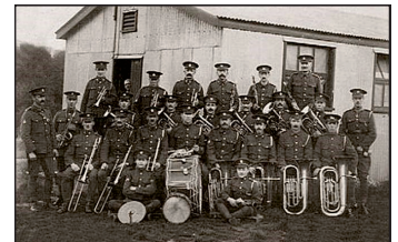
The Military Band of the Remount Depot outside one of the huts

Now a new use is being found for the restored quarry land and soon Romsey will have its own crematorium in a rural setting and many more of us will have reasons to turn into Ridge Lane, albeit not the carefree ones of blackberry picking.